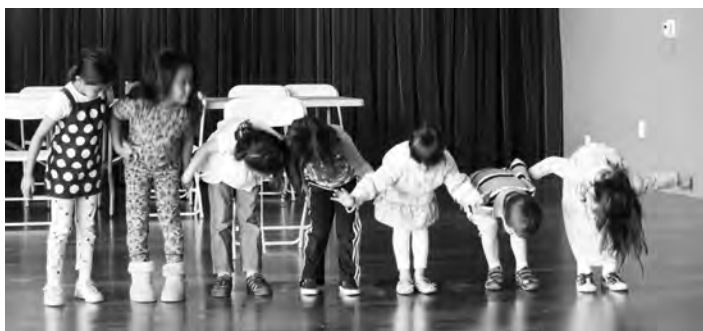
Theatre Tots – Creative Dramatics for children ages 4-6.