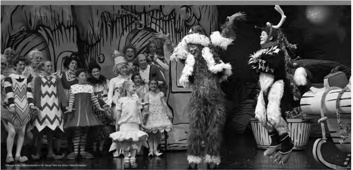
The cast of the 2009 production of Dr. Seuss' 'How the Grinch Stole Christmas'