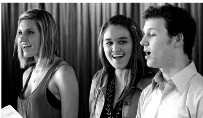
Globe Honors – An awards program for high school theatre students.

The Old Globe's Education department eagerly awaits the "Grinch Season" because it's the time that it seems the whole world turns its attention to children. This is the season of giggling and grinning, skipping and scampering, wishing and wondering. It's the time of year that sparkling lights and jingling bells are the backdrop of everything we do. There's a bit of magic and merriment at this time of year, and the joyful laughter of thousands of children as they experience Dr. Seuss' How the Grinch Stole Christmas! stays in one's memory throughout the year.