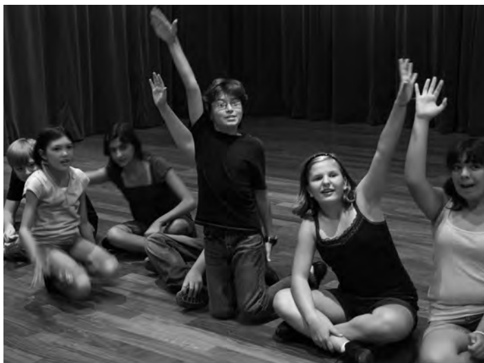
Middle School Conservatory – A two-week conservatory-style program for students in grades 6-8.